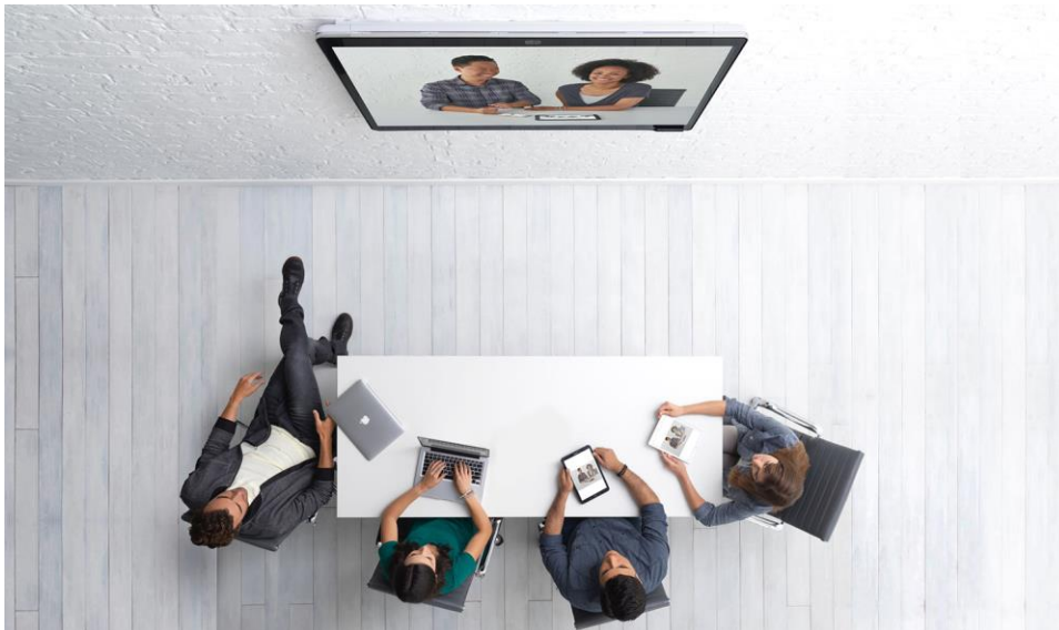
Figure 2. Video Conferencing on the Cisco Spark Board

The Cisco Spark Board is the latest addition to the portfolio of Cisco Spark video and audio conferencing devices that register to the Cisco Collaboration Cloud, including the Cisco TelePresence® MX and SX Series, the DX Series, the Cisco IP Phone 7800 and 8800 Series, and the Cisco Spark Room Kit Series .